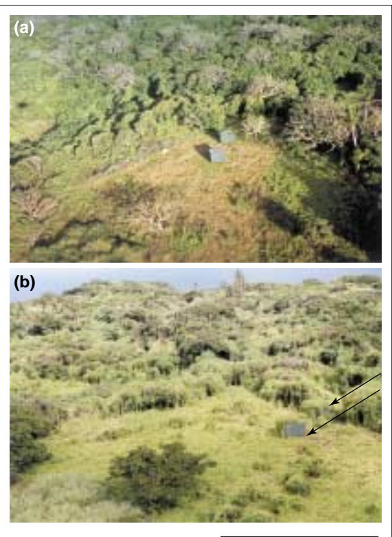
TRENDS in Ecology & Evolution

Fig. 2. An adverse effect of eradication. The photographs show a camp site on Sarigan Island, Commonwealth of the Northern Mariana Islands, before (a) and after (b) successful eradication of feral goats Capra hircus and pigs Sus scrofa in 1998 explosively released a previously undetected exotic vine Operculina ventricosa. Arrows in (b) indicate the locations of the two buildings visible in (a)