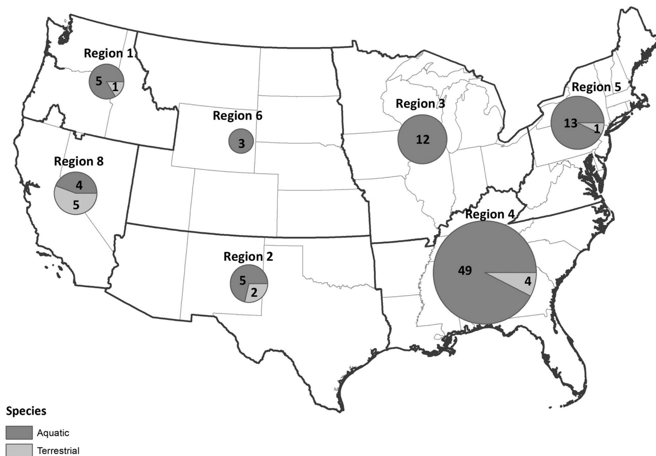
Figure 1. A Fish and Wildlife Service (FWS) Regional Map of the continental United States, with the relative magnitude and distribution of federally listed plant and wildlife species (terrestrial versus aquatic) documented as impacted by nitrogen (N, from atmospheric deposition or aquatic runoff).

N pollution increasing nonnative plant species, directly harming a species through competition. Five federally listed plant species ( Astragalus tener var. titi , Clarkia franciscana , Hackelia venusta , Helonias bullata , and Paronychia chartacea ) were directly harmed through competition with a nonnative species (table 3). For example, C. franciscana is a native species in California serpentine grasslands that, like many native serpentine plants, is outcompeted by nonnative annual grasses (box 1; Harrison and Viers 2007). Increasing levels of N pollution in many nutrient-limited ecosystems may affect native species via several mechanisms, including interspecific competition and changes in interactions with herbivores and pathogens (Gilliam 2014). These community alterations can transform species composition by creating environmental conditions more favorable for faster-growing plants, such as exotic grasses, than for native plants that are adapted to nutrient-deficient soils (Bobbink et al. 2010, Gilliam 2014). Such a shift in resource availability may be the primary mechanism controlling invasive establishment and persistence in many ecosystems (Davis and Pelsor 2001, Ochoa-Hueso et al. 2011). Researchers have investigated